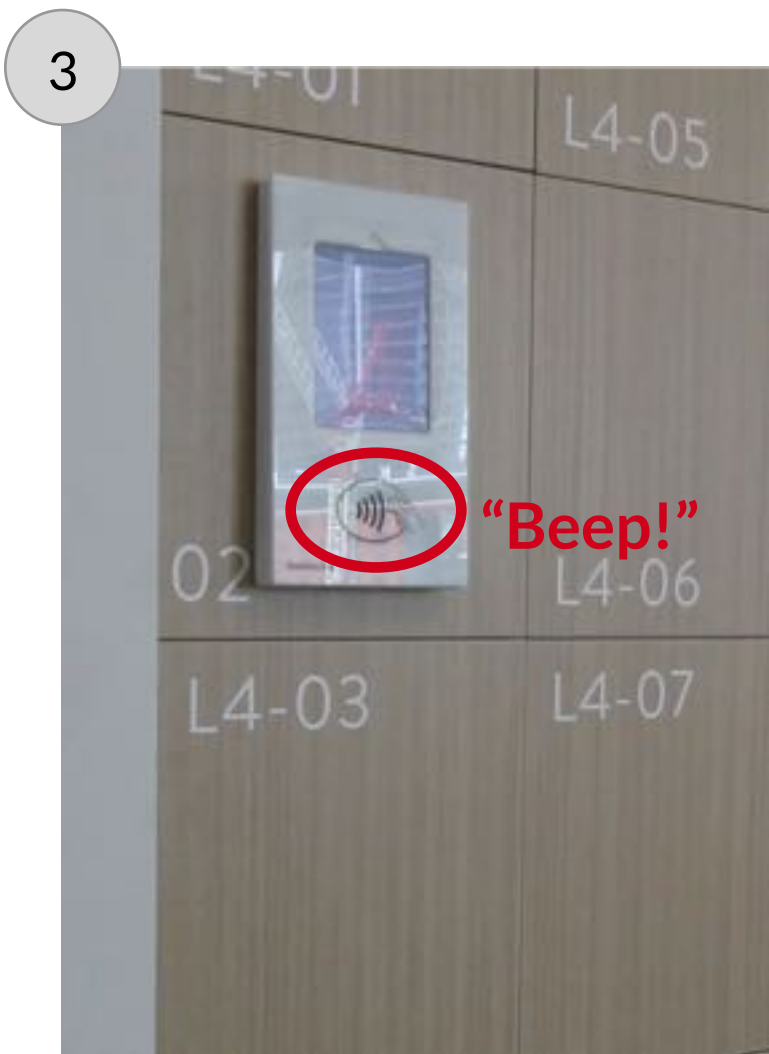
Listen For Beep

The card reader should make a single audible beep when it is reconnected to the Controller