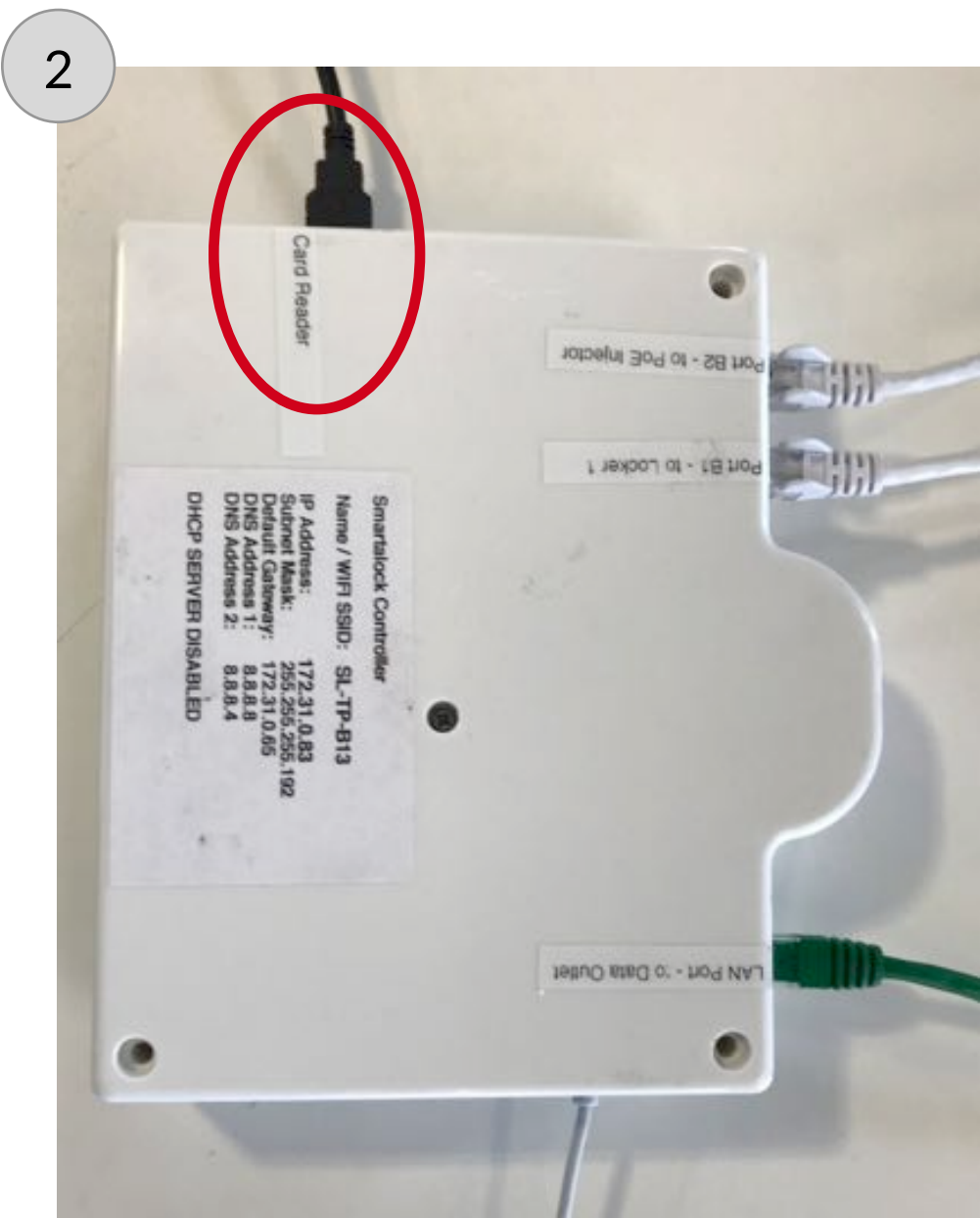
Unplug the Replug the Card Reader Cable

Locate the Black USB cable going into the controller - there is only 1 black USB cable going into it. Unplug this cable, wait 5 seconds, then plug it back in. If the controller has provided power to the card reader it should make a single beep