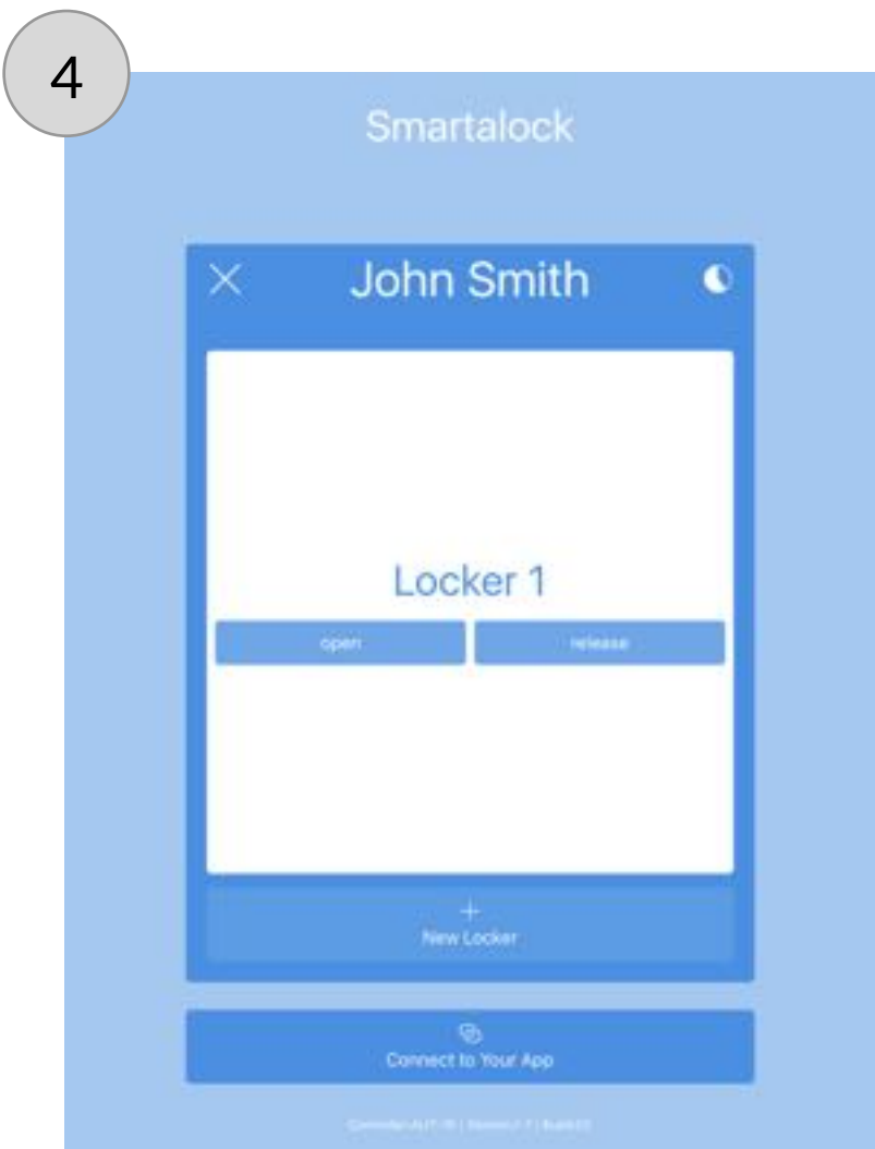
Test Card Now Reads

Swipe a card that is known to work against the card reader and watch for the Kiosk to respond. If reader beeps then try once more. If Kiosk still does not respond then try one of the alternative solutions below Solution Method Restart Kiosk App “K” Check Card Reader “E” Controller Power Reset “F”